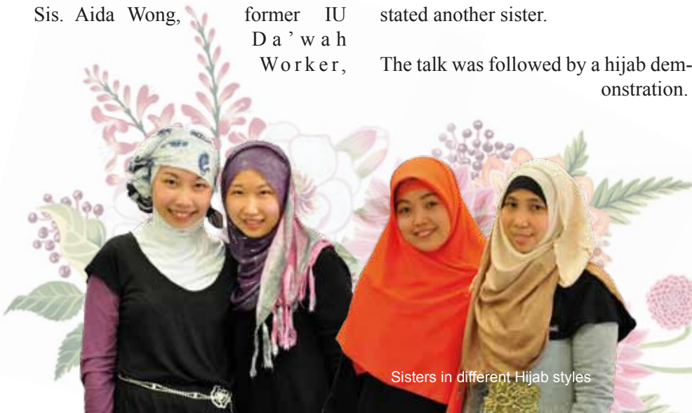
Sisters in different Hijab styles

The programme ended with a dua by Imam Uthman Yang Xin Ben.