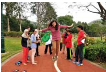
Players enjoying the race