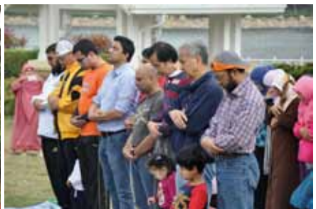
Brothers and sisters praying on the lawn