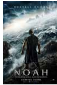
Poster of 'Noah'

Some of the Middle Eastern countries have banned the Hollywood film 'Noah' following a Fatwa against the film by Cairo's Al-Azhar, the highest authority of Sunni Islam and a main centre of Islamic education.