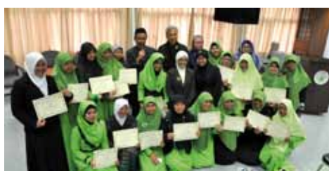
Sisters proudly display their certificate after the presentation ceremony

A group of 20 sisters from Halaqoh (Friday) recently completed their 3-month basic sewing class training at Masjid Ammar and O.R. Sadick Islamic Centre. They will soon embark on the intermediate sewing class. After completion, the sisters will advance to the 'Advance Course'. The sisters when they completed the advance course, they can make different kinds of ladies clothing and can work independently. The programme is supported and sponsored by the Welfare Committee of the Union.