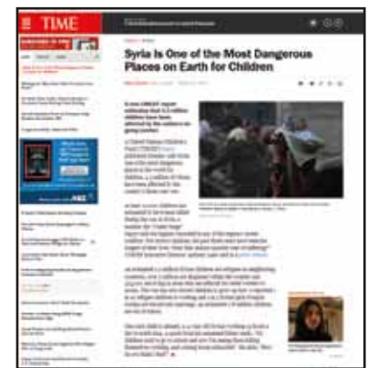
Website Page of Time