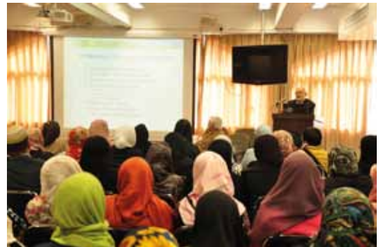
Jamal Badawi博士為香港教胞做講座

大約一百多名兄弟姊妹參加了兩場演講。尤其是關於“伊斯蘭婦女的地位”的演講，大家都踴躍提問。Badawi博士作爲一位知名的穆斯林學者，在伊斯蘭研究的許多領域都頗有成就，他為在場的聽眾解答了所有的提問。