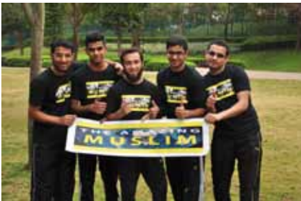
"The Amazing Muslim" race winners

The group returned to Masjid Ammar in time for Asr prayer.