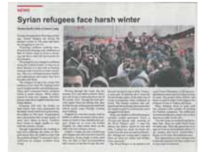
The Muslim News