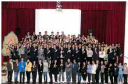
當日參加感恩日活動的各機構代表

香港懲教署首個“在囚人士感恩日”於2013年12月6日圓滿舉行，楊興本教長代表香港伊斯蘭聯會與香港回教基金總會應邀出席，該活動旨在答謝與懲教署長期合作的非政府機構與義工。