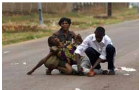
A woman is cared for after she was injured by a tear-gas canister fired by African Union soldiers to disperse a crowd.

The United Nations refugee agency said on 7 February, around 20,000 people have now fled to Cameroon to escape communal bloodshed in the country following a coup in March last year that ousted long-time leader