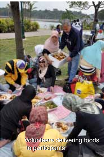
Volunteers delivering foods to participants