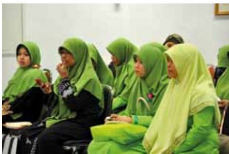
Sisters attending the presentation ceremony