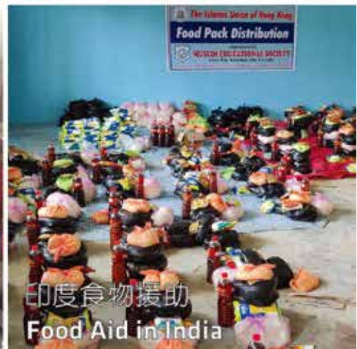
印度食物援助 Food Aid in India