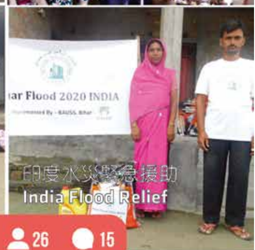
印度水災緊急援助 India Flood Relief