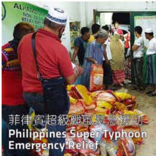
菲律賓超級颱風緊急援助 Philippines Super Typhoon Emergency Relief