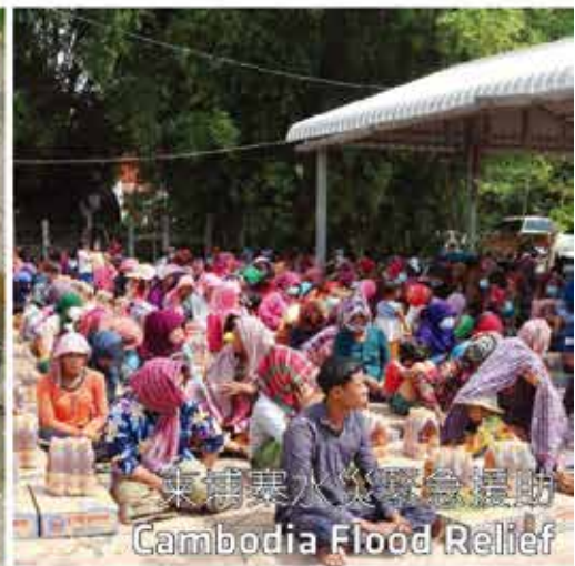
柬埔寨水災緊急援助 Cambodia Flood Relief