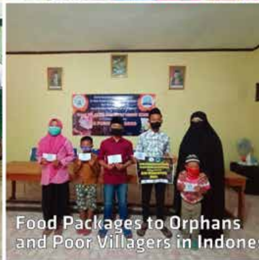
Food Packages to Orphans and Poor Villagers in Indonesia