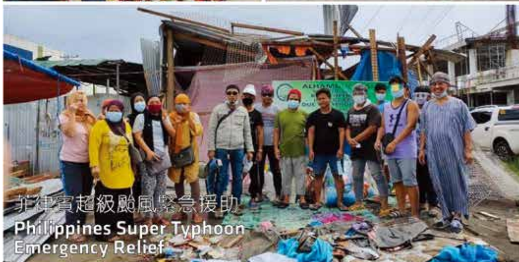
菲律賓超級颱風緊急援助 Philippines Super Typhoon Emergency Relief