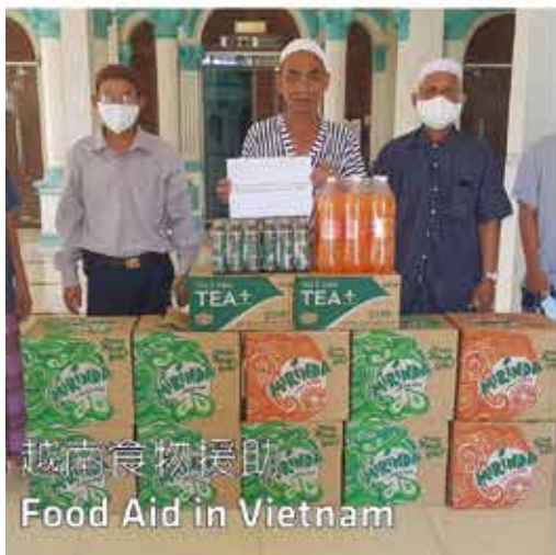
越南食物援助 Food Aid in Vietnam