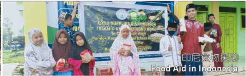
印尼食物援助 Food Aid in Indonesia