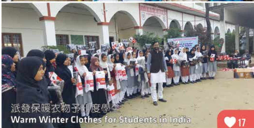
派發保暖衣物予印度學生 Warm Winter Clothes for Students in India