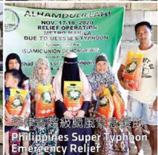
菲律賓超級颱風緊急援助 Philippines Super Typhoon Emergency Relief