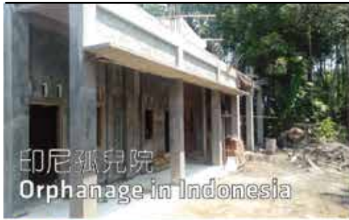
印尼孤兒院 Orphanage in Indonesia