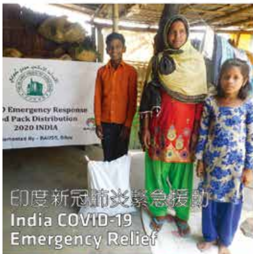
印度新冠肺炎緊急援助 India COVID-19 Emergency Relief