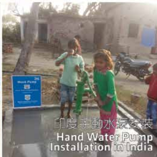
印度手動水泵安裝 Hand Water Pump Installation in India